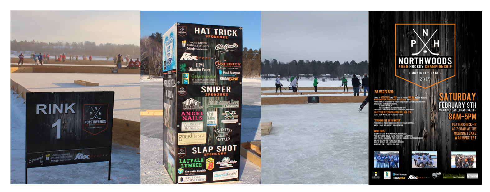
Company logo on rink signage